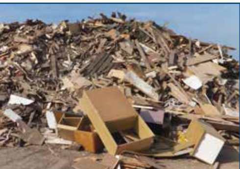
WOOD WASTE A1 – A4 Demolition wood, pallets, chipboard, cable drums, railway sleepers