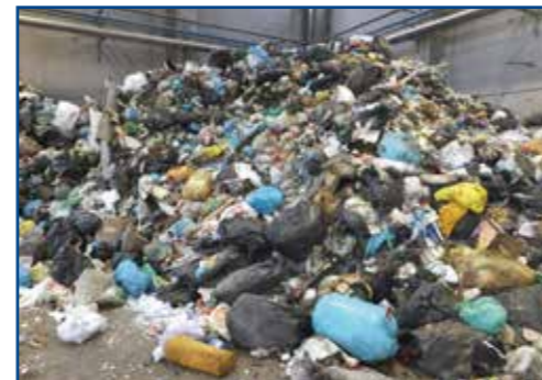
WASTE Domestic waste, organic waste, plastics, PVC