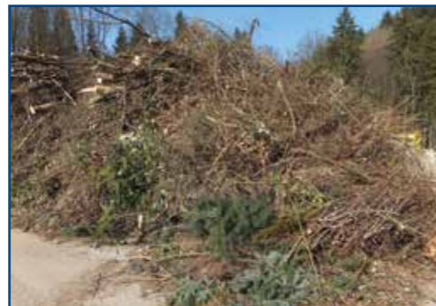
BIOMASS Green waste, rootstock, log wood, palms, animal manure, silo bales, grass cuttings