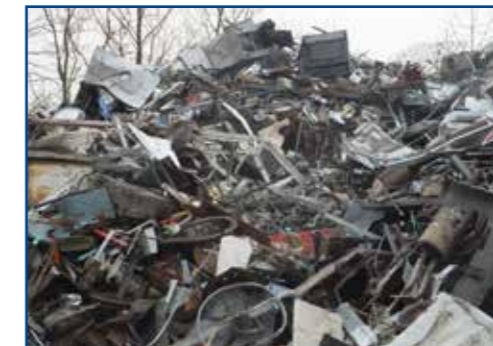
METAL- & LIGHT SCRAP electric and electronic scrap, alu scrap and alu housings