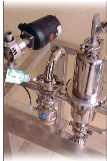
TC(R)-KUB® in test facility

The signalling function corresponds to that one of the opening dry contact. In case of bursting the TC(R)-KUB® reverse acting buckling pin disc resp. if dynamic pressure is sensed the electrical intrinsically safe closed circuit is interrupted. This interruption in the closed circuit can be used by means of an approved isolated switch amplifier with relay output or the like for signalling and/or process controlling.